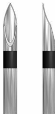
Corroded echo marking